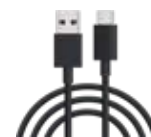
USB Type-C cable