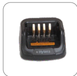
MUC Rapid-rate Charger