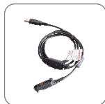
Programming cable PC155