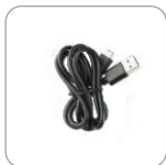
Data cable PC143